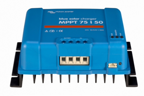
Solar charge controller MPPT 75/50