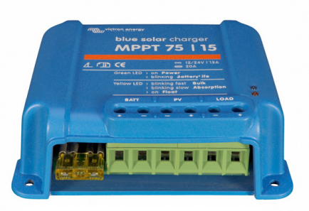
Solar charge controller MPPT 75/15